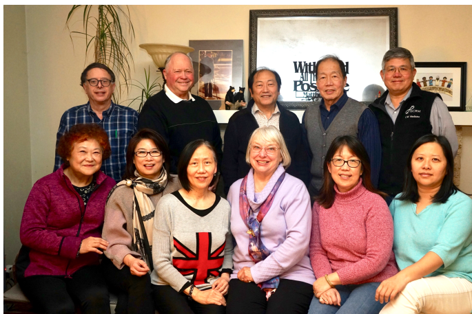
MCCH Board Members and Staff