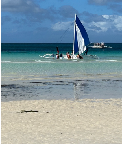
Peace be Still

God's work has been continuous, allowing our family to be blessed and changed by the Holy Spirit, constantly experiencing Him, and building faith to become people who are in line with God's will! I give all the glory and praise to the Father in heaven!